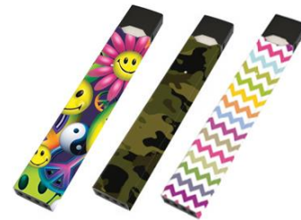
JUUL skins.

According to data from Wells Fargo, JUUL’s popularity has grown dramatically in the last year, representing 46.8% of the market share* in the last quarter of 2017, compared to 25% at the same point in 2016. As a result, JUUL is now more popular than the e-cigarette brands manufactured by the major tobacco companies (blu, Vuse, and MarkTen). 3