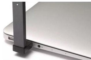
JUUL device charging in the USB port of a laptop.

JUUL Labs produces the JUUL device and JUULpods, which are inserted into the JUUL device. In appearance, the JUUL device looks quite similar to a USB flash drive, and can in fact be charged in the USB port of a computer. According to JUUL Labs, all JUULpods contain flavorings and 0.7mL e-liquid with 5% nicotine by weight, which they claim to be the equivalent amount of nicotine as a pack of cigarettes, or 200 puffs. JUULpods come in five flavors: Cool Mint, Crème Brulee, Fruit Medley, Virginia Tobacco, Mango, as well as three additional limited edition flavors: Cool Cucumber, Classic Tobacco, and Classic Menthol. 1 Other companies manufacture “JUUL-compatible” pods in additional flavors; for example, the website Eonsmoke sells JUUL-compatible pods in Blueberry, Silky Strawberry, Mango, Cool Mint, Watermelon, Tobacco, and Caffé Latte flavors. 2 There are also companies that produce JUUL “wraps” or “skins,” decals that wrap around the JUUL device and allow JUUL users to customize their device with unique colors and patterns (and may be an appealing way for younger users to disguise their device).